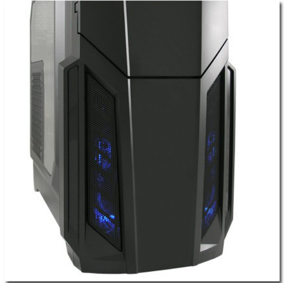
- incl. one blue lighted 120 mm case fan (up to four case fans mountable)