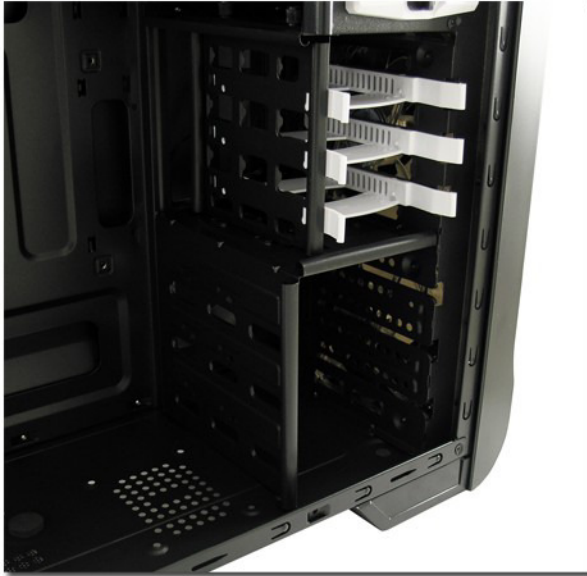
- removable mounting frame for 2,5" HDDs/SSDs to mount in graphic cards up to 340 m