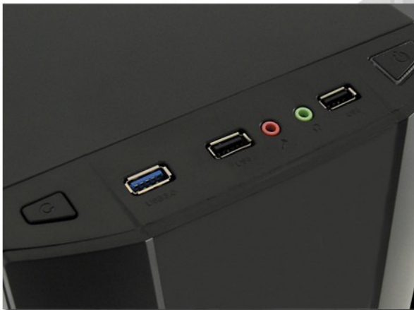
- I/O-Panel with: 1x USB 3.0 port, 2x USB 2.0 port, HD Audio