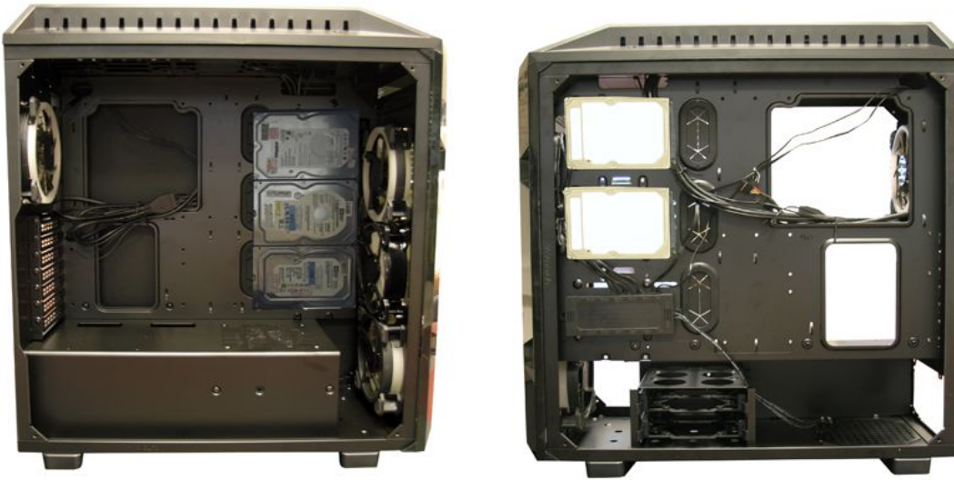
#Additional 3x 3.5" HDD on MB tray